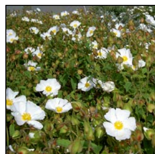
Cistus x corbariensis